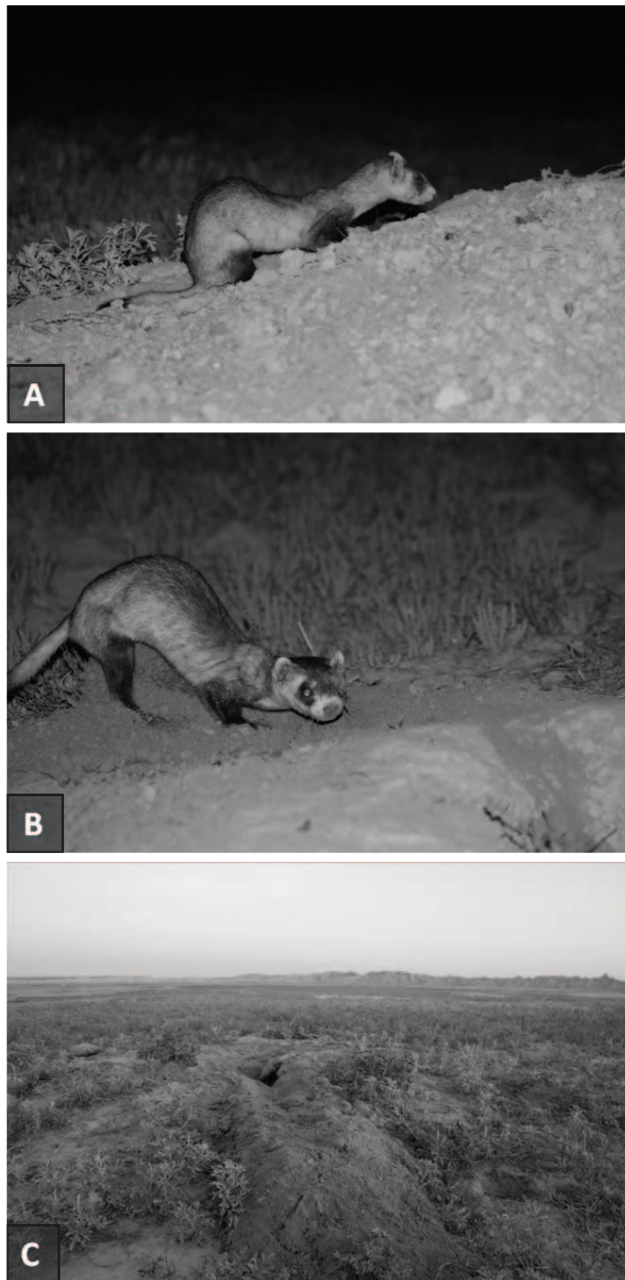
Fig. 1. A, Female black-footed ferret ( Mustela nigripes ) 05-006 using her forelegs to pull dirt from a black-tailed prairie dog ( Cynomys ludovicianus ) burrow opening; B, female ferret 02-001 using her hind legs to push dirt away from a prairie dog burrow opening; C, a characteristic ferret dig (extending into foreground) created by female 02-001.